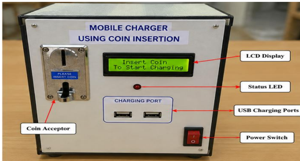
Fig : Mobile Charger Using Coin Insertion

Step 7 : After completion of charging duration, the controller disconnects the charging supply automatically.