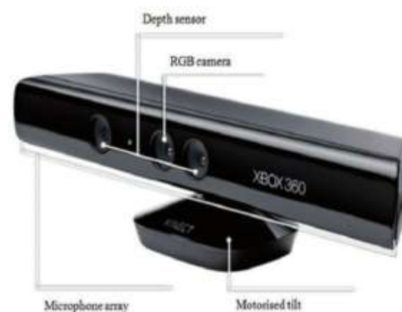
Fig. 3. XBOX Kinect

Camera is also used in assistive technology for blind peoples. The size and price of camera has been significantly reduced over last few years while quality and capability has significantly increased. Camera along with computer makes use of algorithmic approach to analyze and extract information from images. With the improvement in algorithm the accuracy of this assistive technology is increasing. However it requires lot of computation power. In computer vision technique lot of research has been carried out. There has been lot of innovative application provided that involves embedding cameras in a variety of wearables. Xbox Kinect and Project Tango are the example of computer vision technique [3].