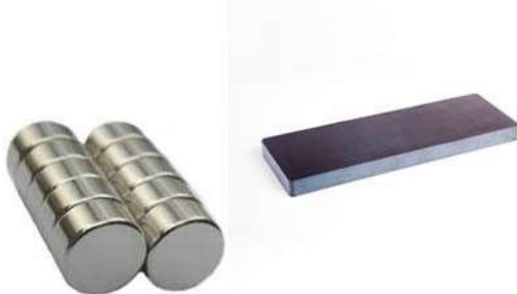
Figure 4: Types of magnet

Ideally the magnet width should be equal to or greater than the coil core. Rectangular magnets give an improved performance over simple discs in order for the magnet field to sweep across the entire face of the coil or close to it[9]. The distance between each magnet cannot less than 1.5 to 2 size of magnet widths. This is because to avoid interactivity of the scalar south poles.