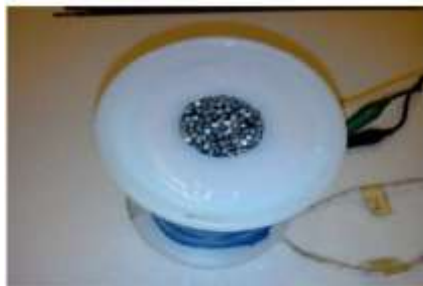
Figure 5: Coil Core

The coil core is metal rod that stuffed in the middle of the coil winding. Normally, it stuffed with welding rod. Other materials can also be used provided the rod compatible to react with the magnet. If the materials retain any magnetism when the magnet is taken away, then they are not suitable. If both south and north attract to both core ends, then such core issuitable.