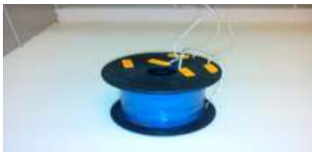
Figure 3: Bifilar Coil for Bedini SSG