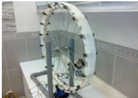
Figure 6: prototype of original Bedini SSG rotor

It is worth noted that anything round and non-magnetic can be used as a rotor[10]. For example, skate board wheels, with a little grinding or machining of the rubber to accommodate the magnets can make a good 3 or 4 pole rotors. Basically smaller diameter, 3 or 4 pole rotors run at higher RPM and draw less current like 6 pole rotor. This may be an important consideration in keeping the current draw down, below the critical battery C20 rate, on the smaller batteries[11]. In addition, it is a wise precaution to wrap some kind of heavy duty strapping tape with the little strings imbedded in it, or even electrical tape around the perimeter of the rotor as a back-up to gluing of the magnetsin.