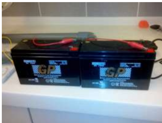
Figure 7: Sealed lead acid battery

In this project, the charging process is usually stopped after a voltage is reached at certain amount[13]. It is recommended to rest the battery a minimum of one hour before charging or discharging. However, in the short term it is fine to cycle the battery without a rest period. Normally, Lead-acid batteries are rated for a 20-hour discharge. The current that will discharge the battery from fully charged is about 13.8 volts to fully discharge around 11.5 volts in 20 hours is called the C20 rate [9].